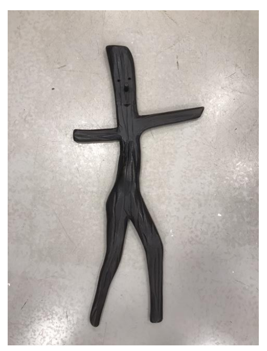
This is Stickman

Stickman is a large wooden stick with arms and legs. He doesn't speak or move and is held by The Gruffalo's Child.